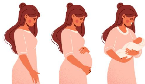
1st Prenatal Visit 28-30 weeks Delivery