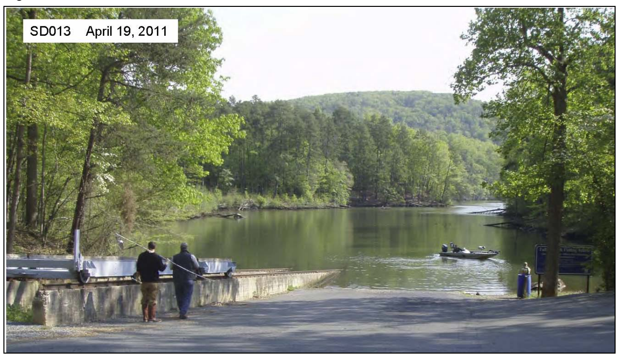
Figure 3. Falls Reservoir 2011 sediment collection location "SD013".