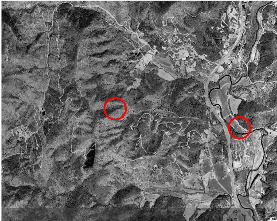
USGS Orthophotoquad: Prentiss 7.5' Quadrangle 4-14-94